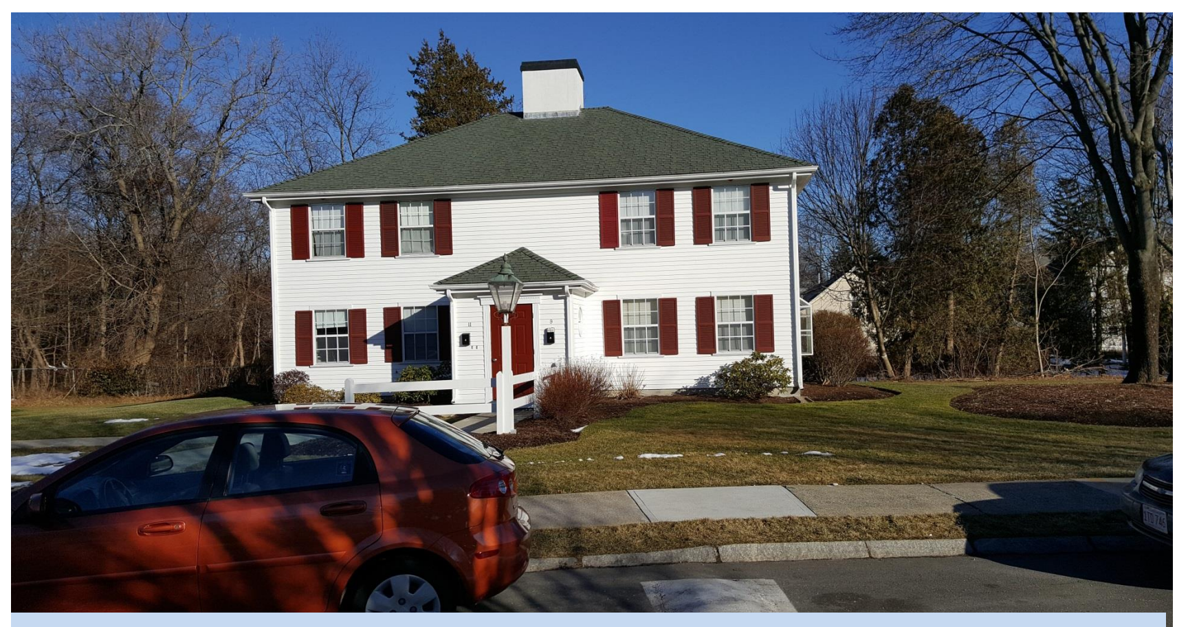
This is a project based section 8 property, federally subsidized by HUD. 266 units.