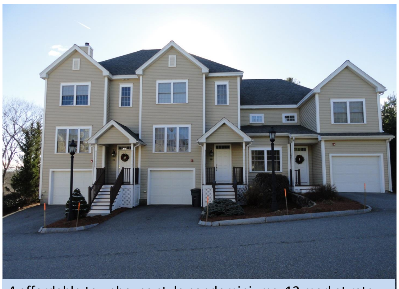
4 affordable townhouse style condominiums. 12 market rate units.