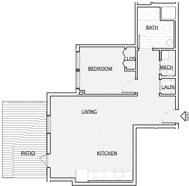
One Bedroom, One Bath 730 Sq. Ft.