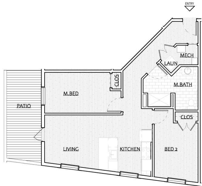
Two Bedroom, One Bath 874 Sq. Ft.